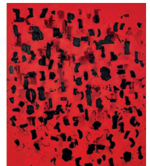
Debris Field (Red) #20, 2021

Contact: Delphine Verrières-Gaultier – Carré d'Art