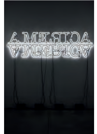
Double America, 2012