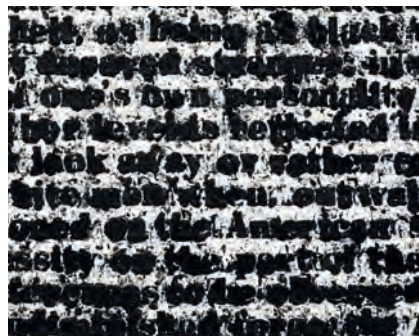
Stranger (Full Text) #1, détail, 2020-21