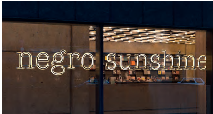
Warm Broad Glow II, 2011